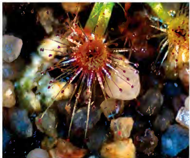
Figure 1: Drosera callistos with springtail below the front snap-tentacles.

Very rapid catapulting tentacle movements have only previously been reported